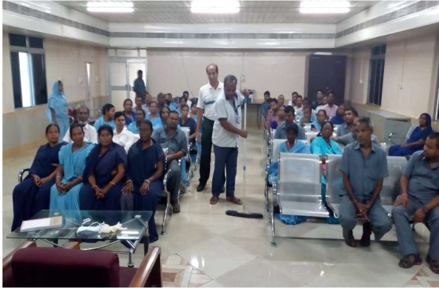
Vector Control Measures - Demonstration of spraying of chemical agents for mosquito control.