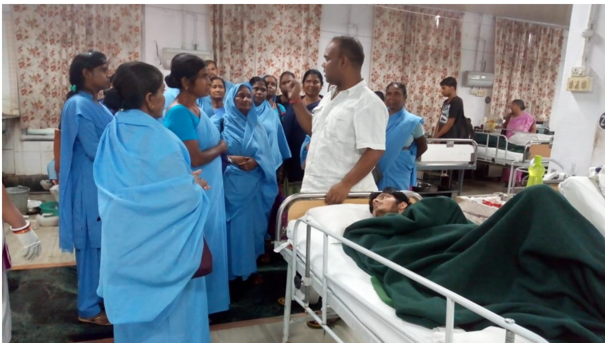
Training of staff in Bio Medical Waste Disposal.