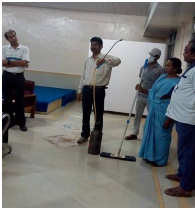
Training of staff in OT activities.