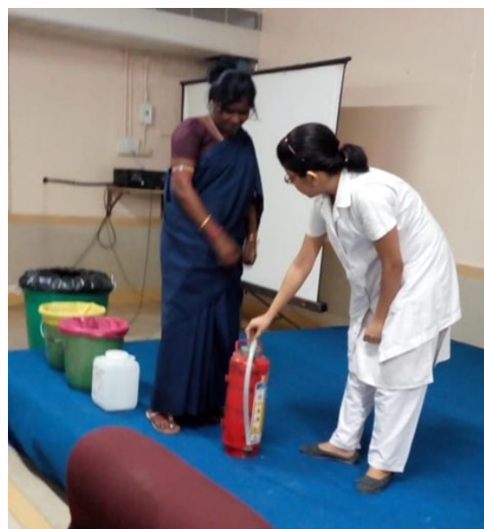
Training of staff in Fire Fighting by Staff Nurse/HWH