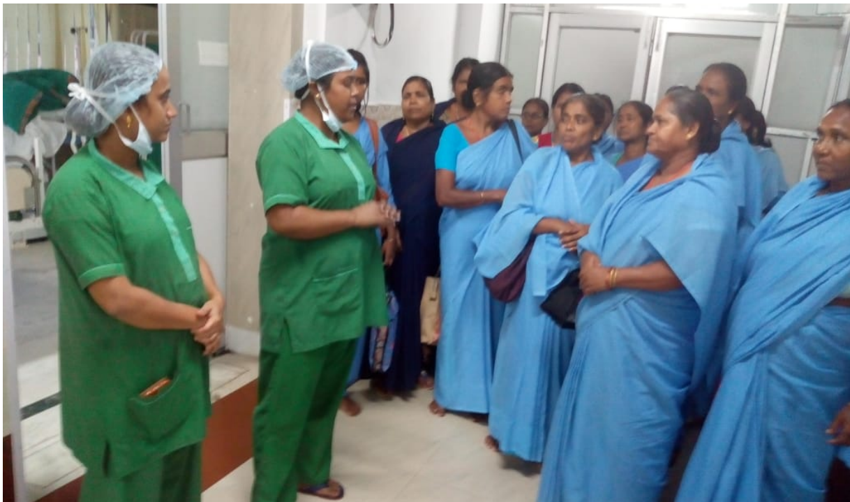
Training of staff in indoor activities.