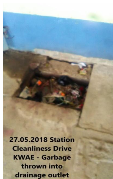
27.05.2018 Station Cleanliness Drive KWAE - Garbage thrown into drainage outlet