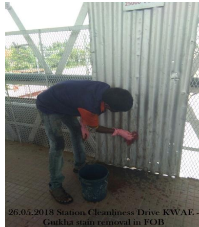
26.05.2018 Station Cleanliness Drive KWAE - Gukha stain removal in FOB