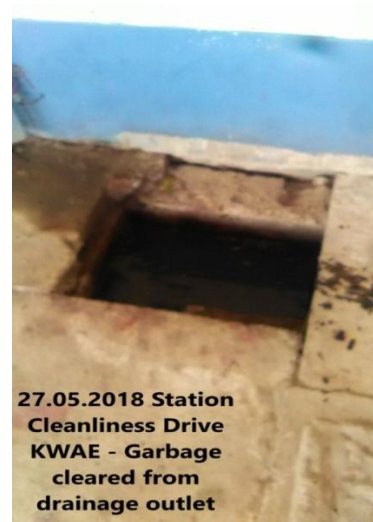
27.05.2018 Station Cleanliness Drive KWAE - Garbage cleared from drainage outlet