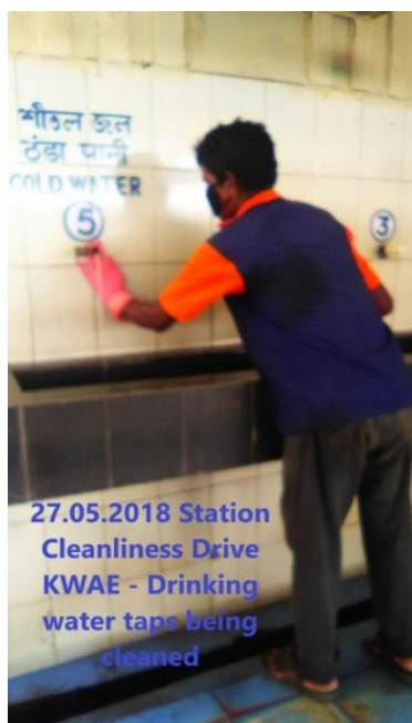
27.05.2018 Station Cleanliness Drive KWAE - Drinking water taps being cleaned