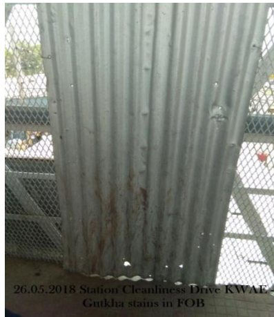
26.05.2018 Station Cleanliness Drive KWAE - Gukha stains in FOB