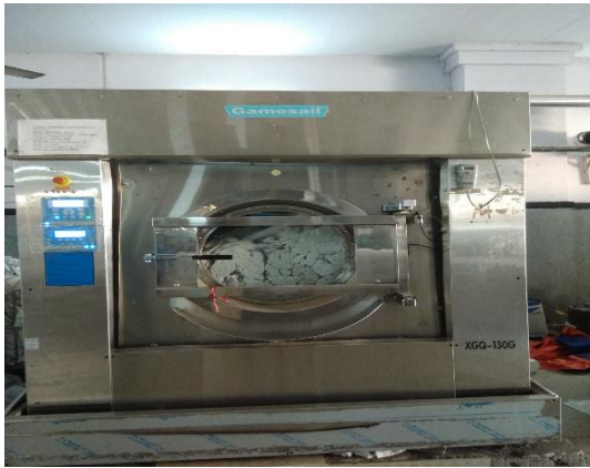
Washing of linen