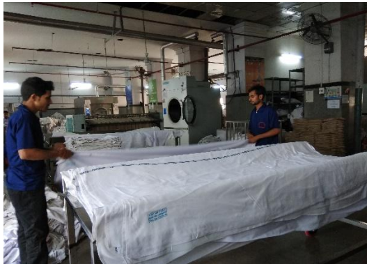
Folding of linen