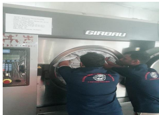
Loading of linen in washer cum extractor