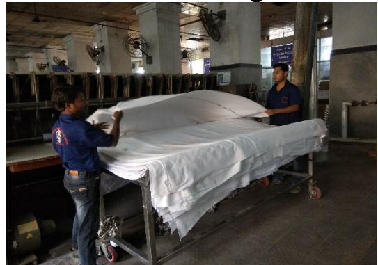
After Calendaring/Ironing of linen