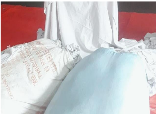
Entry of Dirty linen