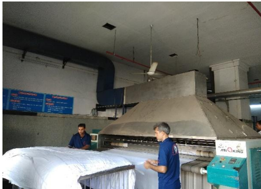
Before Calendaring/Ironing of linen