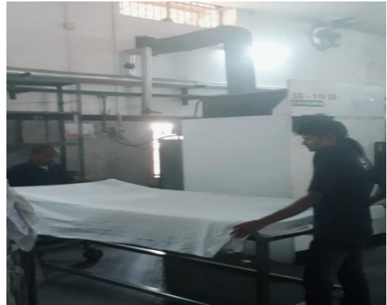
Stretching of Linen before calendaring