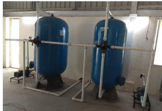
Water softener Plant