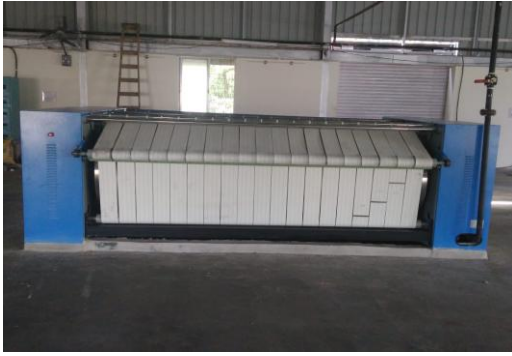
Industrial Big Flat work Ironer