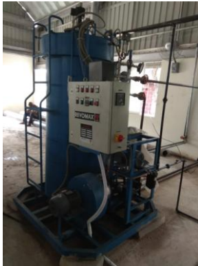
Small Industrial Boiler