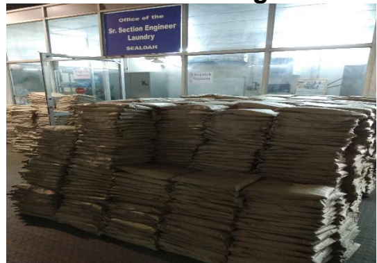
Linen Ready to despatch