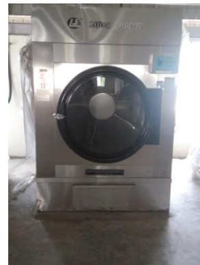
Industrial Tumbler Drier for Towel