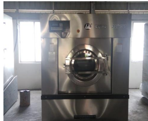
Industrial Washer Extractor for Pillow Cover & Towel