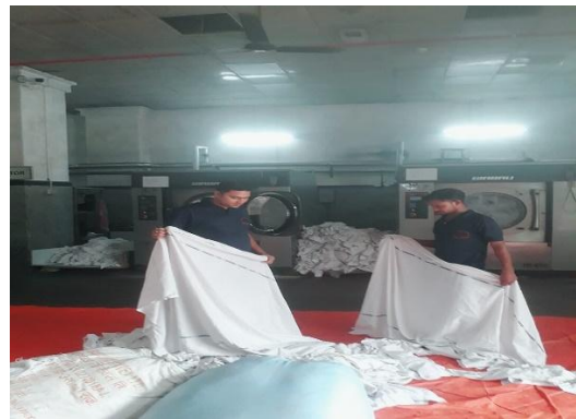
Segregation of dirty Linen