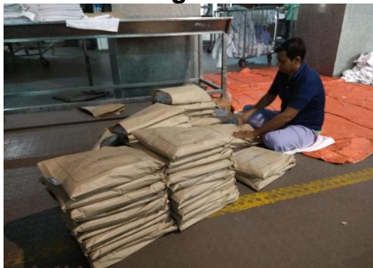
Packaging of linen