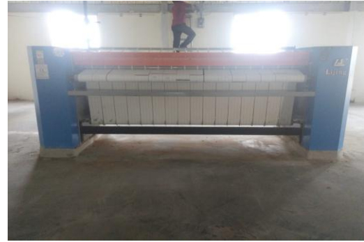
Industrial Small Flat work Ironer