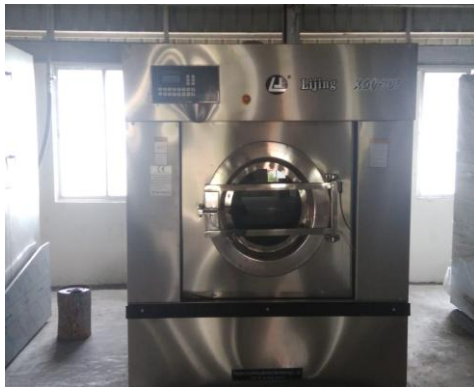
Industrial Washer Extractor for Pillow Cover & Towel