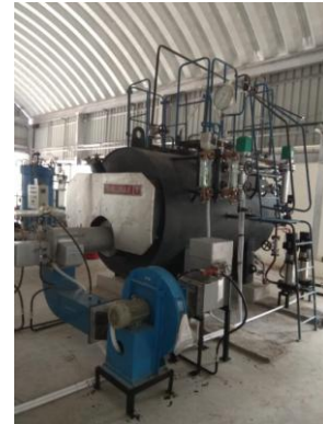
Industrial Big Boiler