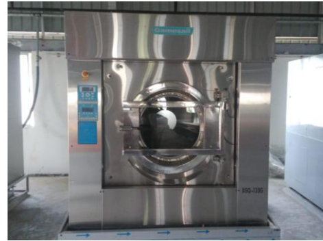
Industrial Big Washer Extractor for Bed Sheet