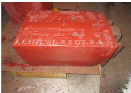
(Wagon Draft Gear)

Before Laser Engraving Machine installed: