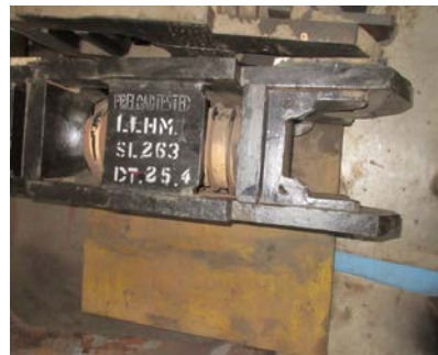
(LHB Draft Gear)

After Laser Engraving Machine installed :