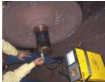
Ultrasonic Flaw Detector

l) Ultrasonic testing facility of any metallic components is available along with Magnetic Particle testing for detection of surface defects of metallic components.