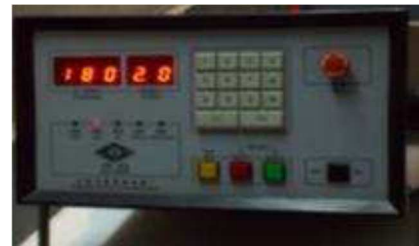
X-Ray Control Panel

X-ray machine for testing of internal flaws of welding is available of capacity 300 KV, 5 mA. Internal Flaw of steel plate upto 15mm thickness is detectable. Qualified radiographer for conducting the test is available.