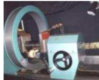
Magnetic Particle Testing m/c