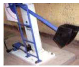
Impact Testing m/c