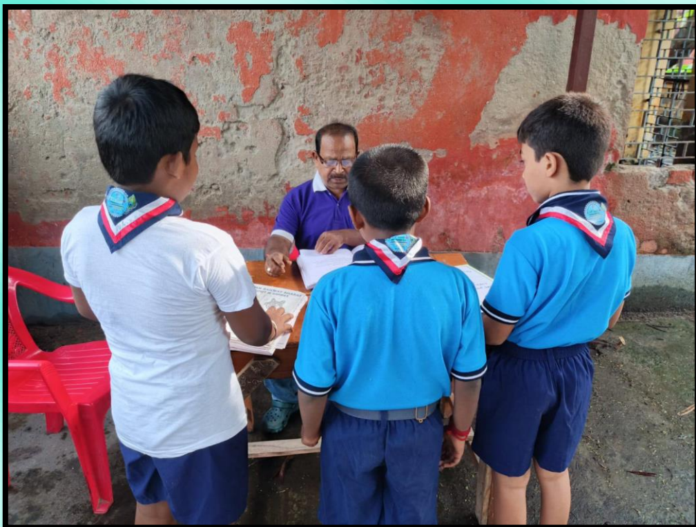
Glimpse of Group level Dwitiya Charan & Tritiya Charan testing organized by cub section.