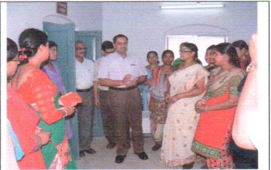
Interaction with ladies employee by CWM/KPA after Inauguration of Ladies Common Room on 13-08-2014.