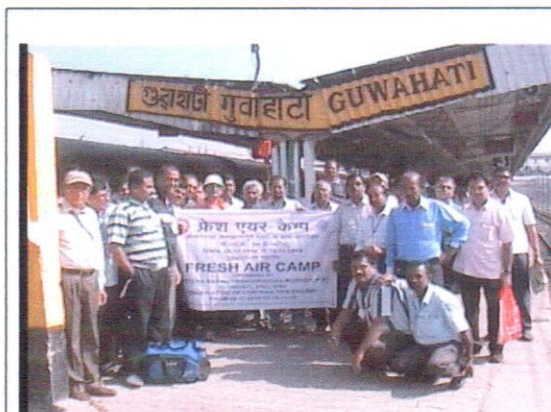
At Guwahati Railway Station during Fresh Air Camp.