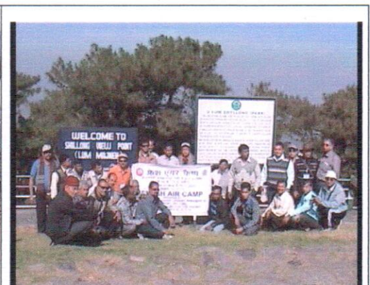
At Shillong during Fresh Air Camp.